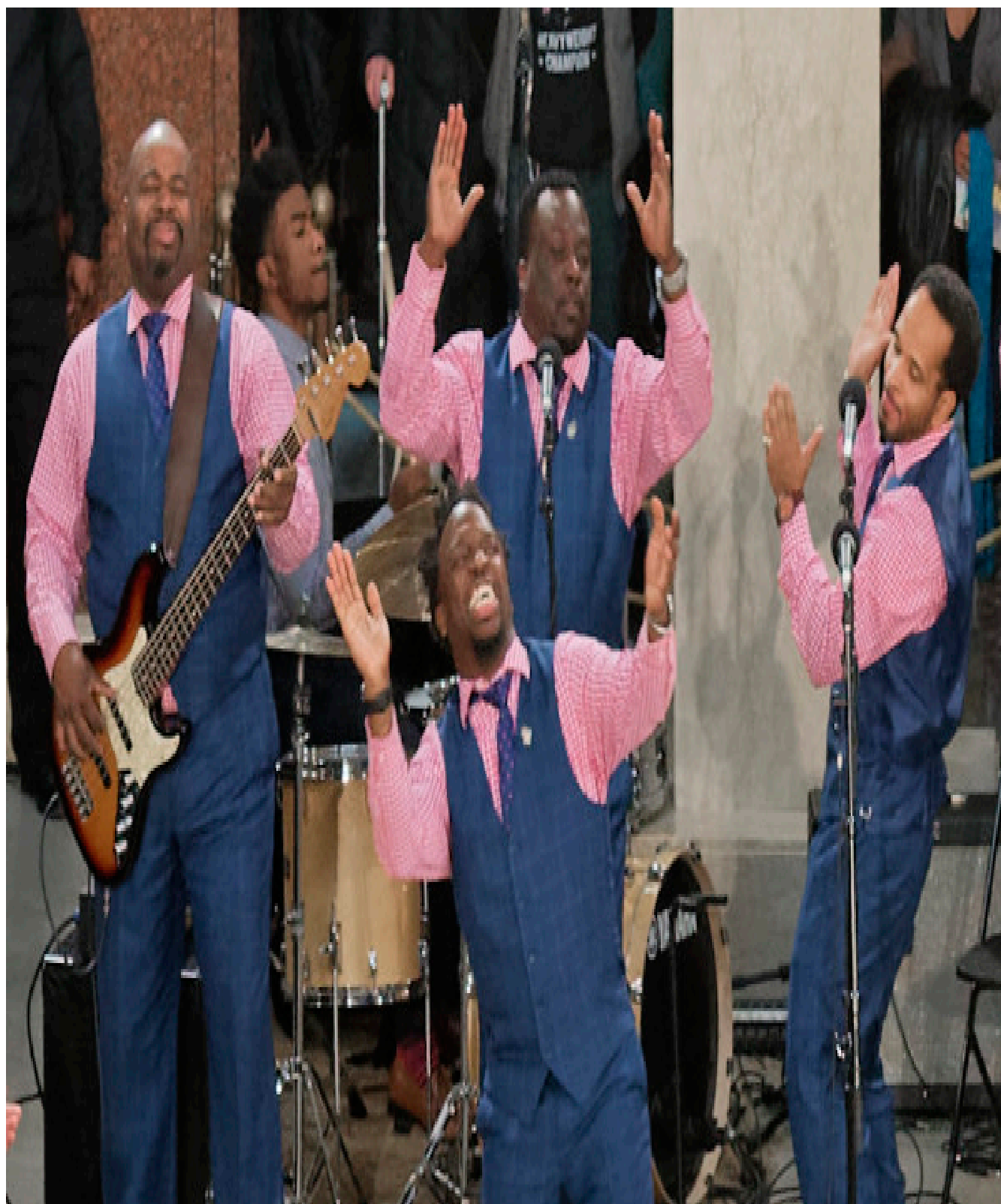
MLK19 Victory Travelers