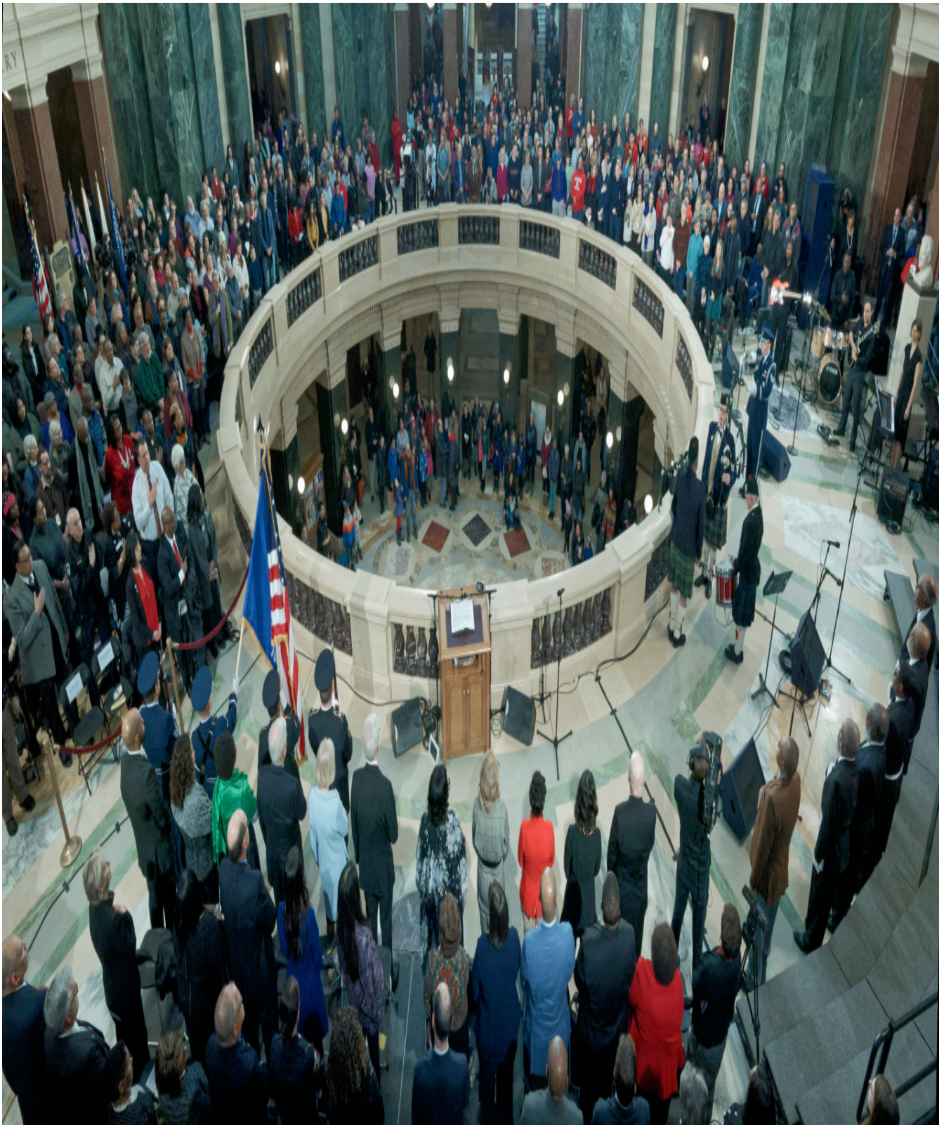
MLK19 Crowd Rotunda