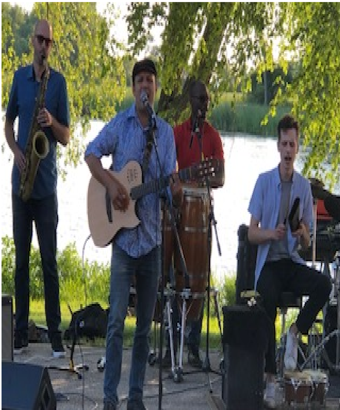
Band performing 2019 summer concert series